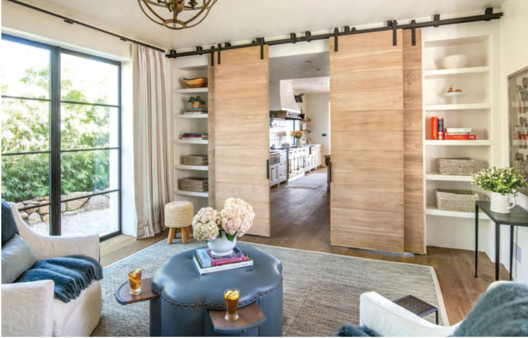
ABOVE: The small living area off the kitchen is a favorite spot to gather for morning coffee and afternoon iced tea. Cathy added a chic touch of dark blue in the accents to give the room a bit of a contemporary edge. BELOW: A small departure from the rustic neutral tones of the rest of the home, the powder room features a graphic Pierre Frey wallpaper in varying shades of blue.