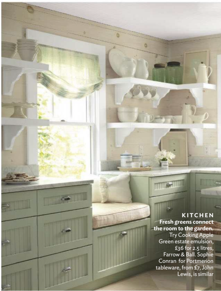
KITCHEN Fresh greens connect the room to the garden. Try Cooking Apple Green estate emulsion, £36 for 2.5 litres, Farrow & Ball. Sophie Conran for Portmerion tableware, from £7, John Lewis, is similar