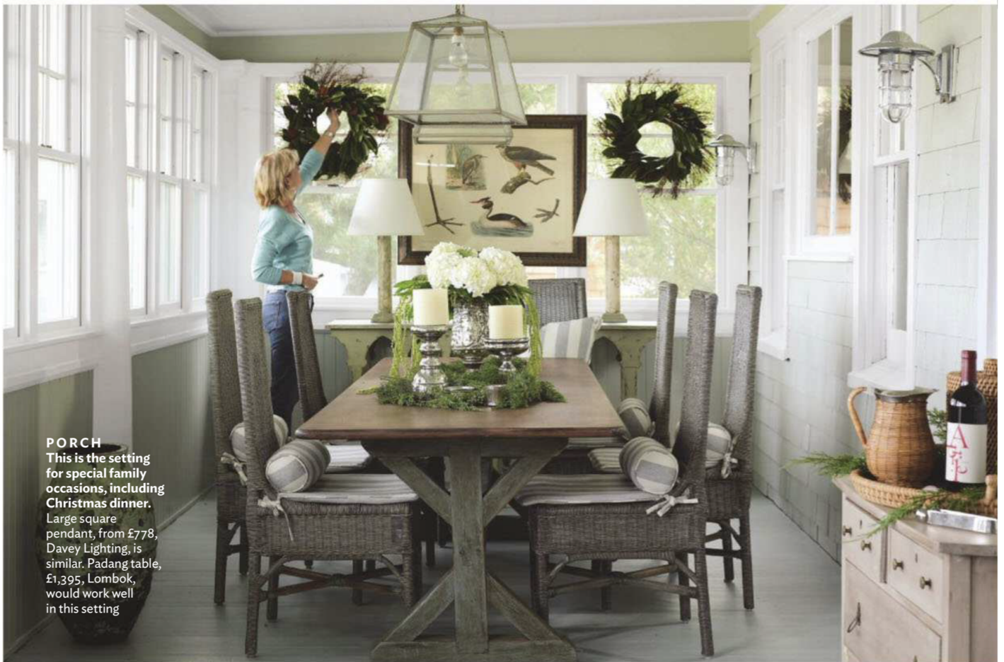
PORCH This is the setting for special family occasions, including Christmas dinner. Large square pendant, from £778, Davey Lighting, is similar. Padang table, £1,395, Lombok, would work well in this setting